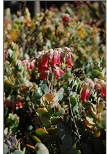
Marnier's Kalanchoe flowers

Marnier's Kalanchoe is a fine choice for the garden, but it is also a good selection for planting in outdoor pots and containers. It can be used either as 'filler' or as a 'thriller' in the 'spiller-thriller-filler' container combination, depending on the height and form of the other plants used in the container planting. Note that when growing plants in outdoor containers and baskets, they may require more frequent waterings than they would in the yard or garden.