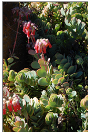
Marnier's Kalanchoe in bloom