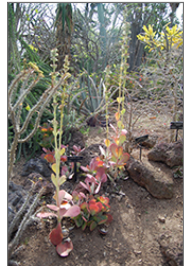
Paddle Plant in bloom