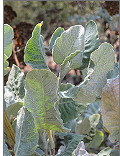
St. Catherine's Lace foliage

This shrub does best in full sun to partial shade. It prefers dry to average moisture levels with very well-drained soil, and will often die in standing water. It is considered to be drought-tolerant, and thus makes an ideal choice for xeriscaping or the moisture-conserving landscape. It is not particular as to soil pH, but grows best in poor soils, and is able to handle environmental salt. It is highly tolerant of urban pollution and will even thrive in inner city environments. This species is native to parts of North America.