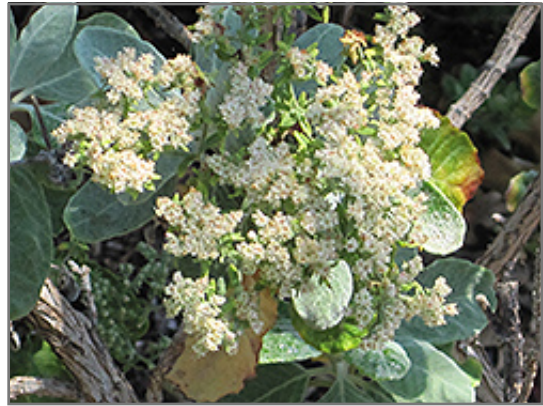
St. Catherine's Lace flowers

St. Catherine's Lace is recommended for the following landscape applications;