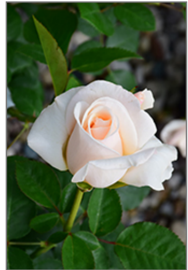
Easy Spirit Rose flowers