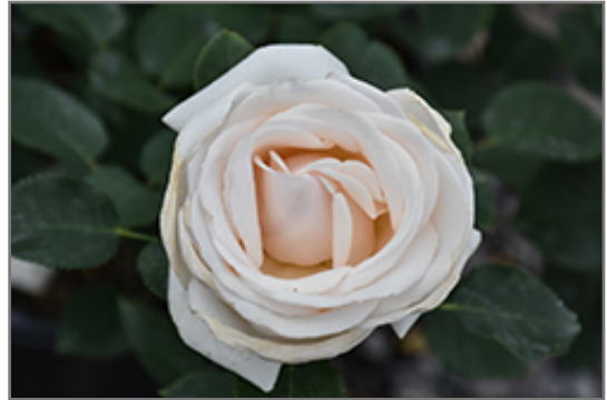
Easy Spirit Rose flowers

Easy Spirit Rose is recommended for the following landscape applications;