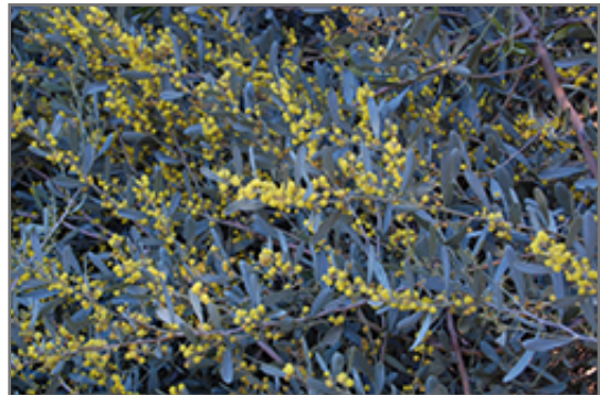
Low Boy Prostrate Acacia foliage