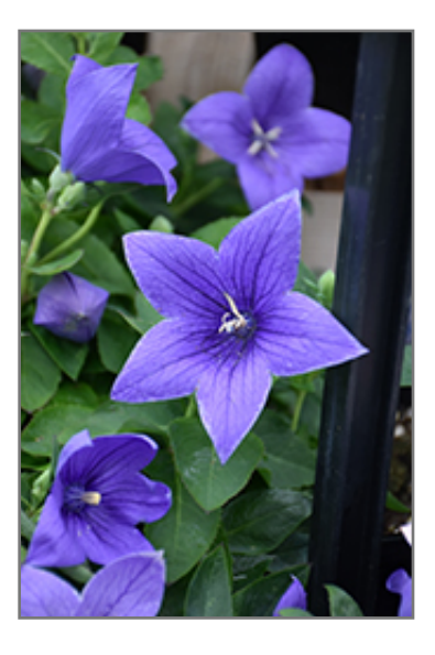
Pop Star Blue Balloon Flower flowers

Pop Star Blue Balloon Flower is recommended for the following landscape applications;