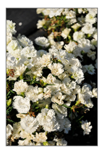
Constant Promise White Pinks flowers