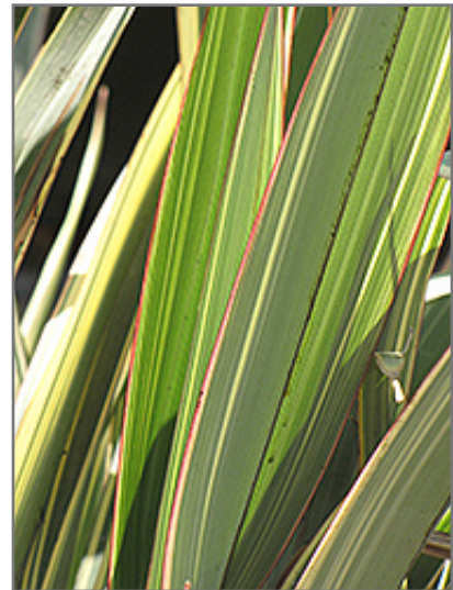
Tricolor New Zealand Flax foliage