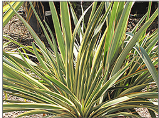
Tricolor New Zealand Flax

Tricolor New Zealand Flax is recommended for the following landscape applications;