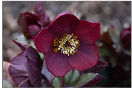
Honeymoon Rome In Red Hellebore flowers