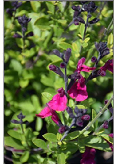
Vibe Ignition Fuchsia Sage flowers

Vibe Ignition Fuchsia Sage is a fine choice for the garden, but it is also a good selection for planting in outdoor pots and containers. With its upright habit of growth, it is best suited for use as a 'thriller' in the 'spiller-thriller-filler' container combination; plant it near the center of the pot, surrounded by smaller plants and those that spill over the edges. Note that when growing plants in outdoor containers and baskets, they may require more frequent waterings than they would in the yard or garden.