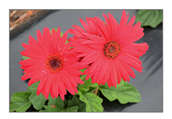
Bengal Rose with Eye Gerbera Daisy flowers

Long blooming and vigorous plants, the Bengal series produces large, rose colored blooms with dark eyes; perfect for adding bright pops of color to patio containers, borders or fresh cut flower arrangements; deadhead to encourage new growth