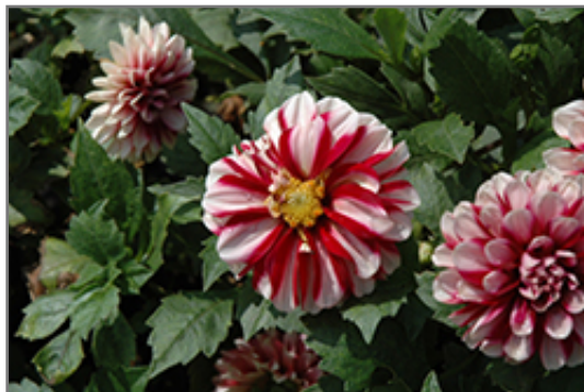
Dalaya Dark Red and White Dahlia flowers