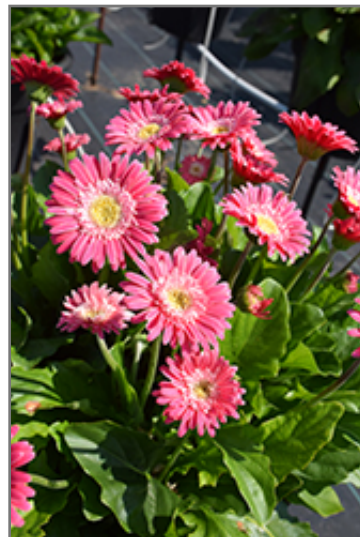
Garvinea Sweet Memories Gerbera in bloom

Garvinea Sweet Memories Gerbera is recommended for the following landscape applications;