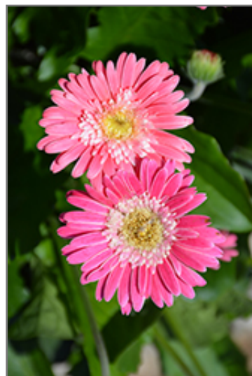
Garvinea Sweet Memories Gerbera flowers