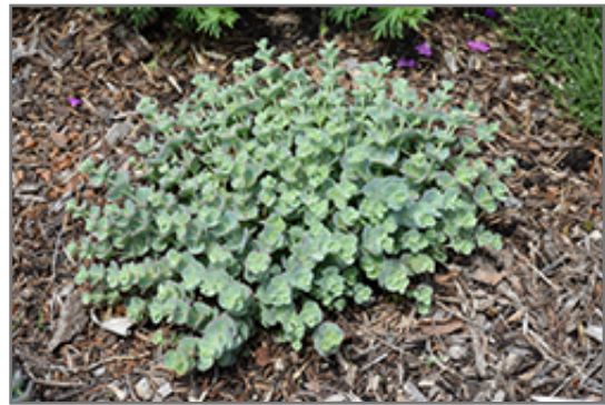
Dwarf October Daphne