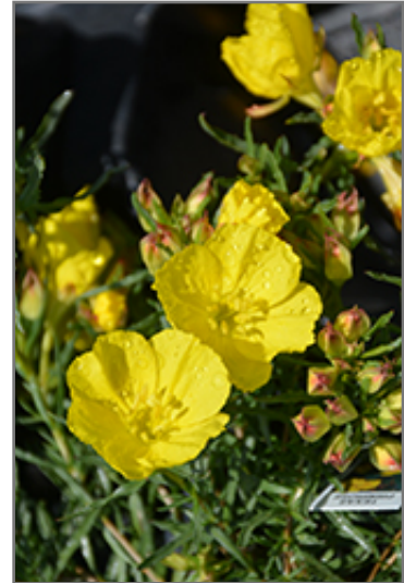
Yellow Sundrops flowers

Yellow Sundrops is a fine choice for the garden, but it is also a good selection for planting in outdoor pots and containers. Because of its spreading habit of growth, it is ideally suited for use as a 'spiller' in the 'spiller-thriller-filler' container combination; plant it near the edges where it can spill gracefully over the pot. Note that when growing plants in outdoor containers and baskets, they may require more frequent waterings than they would in the yard or garden.