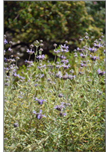
Allen Chickering Sage flowers

This shrub should only be grown in full sunlight. It prefers dry to average moisture levels with very well-drained soil, and will often die in standing water. It is considered to be drought-tolerant, and thus makes an ideal choice for xeriscaping or the moisture-conserving landscape. It is not particular as to soil type or pH. It is somewhat tolerant of urban pollution. This particular variety is an interspecific hybrid. It can be propagated by cuttings; however, as a cultivated variety, be aware that it may be subject to certain restrictions or prohibitions on propagation.