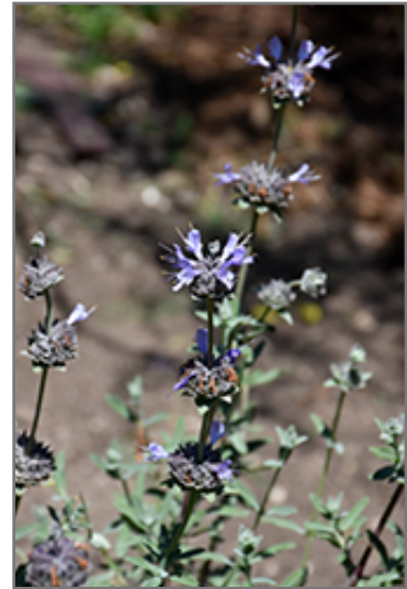
Allen Chickering Sage flowers