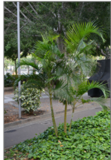
Areca Palm