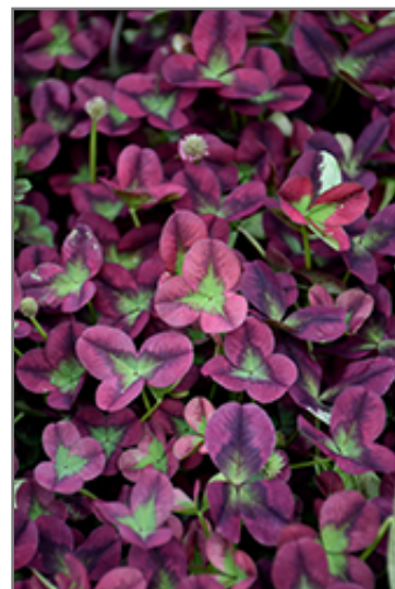
Limerick Isabella Clover foliage