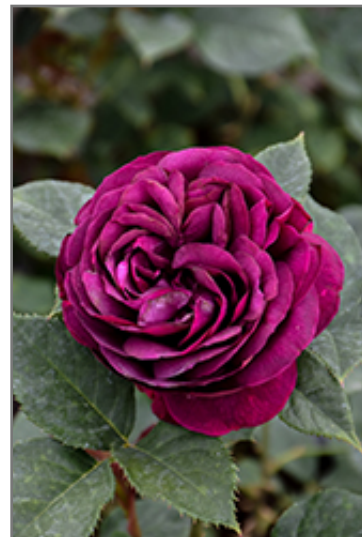
Celestial Night Rose flowers