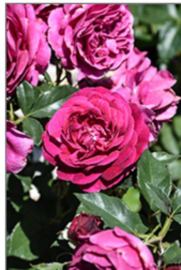
Celestial Night Rose flowers