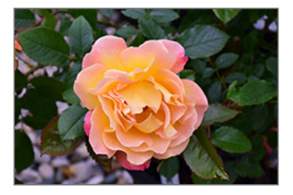
Rosie The Riveter Rose flowers

This shrub will require occasional maintenance and upkeep, and is best pruned in late winter once the threat of extreme cold has passed. It is a good choice for attracting bees to your yard. Gardeners should be aware of the following characteristic(s) that may warrant special consideration;