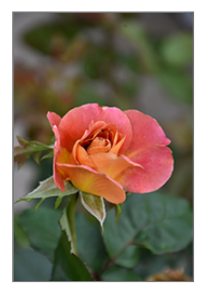
Rosie The Riveter Rose flower buds