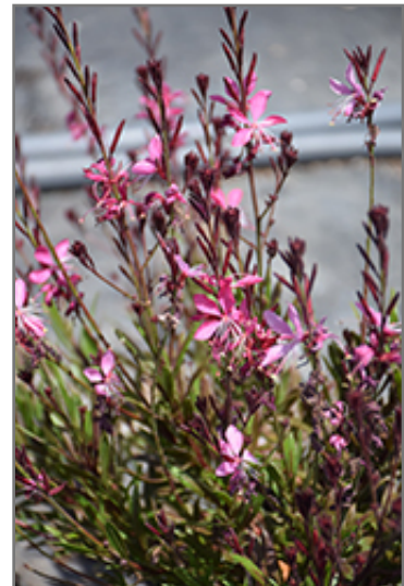
Whiskers Deep Rose Gaura flowers