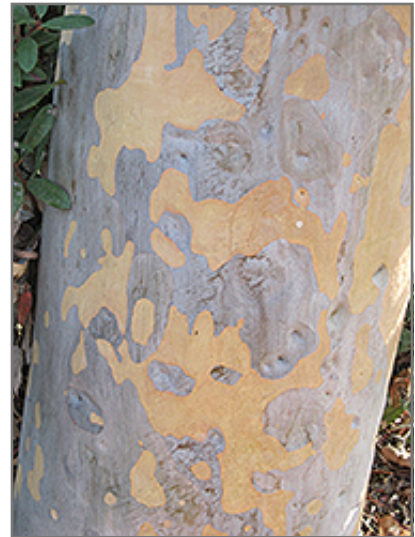
Lemon-scented Gum bark

This tree should only be grown in full sunlight. It prefers dry to average moisture levels with very well-drained soil, and will often die in standing water. It may require supplemental watering during periods of drought or extended heat. It is particular about its soil conditions, with a strong preference for sandy, acidic soils, and is able to handle environmental salt. It is somewhat tolerant of urban pollution. This species is not originally from North America.