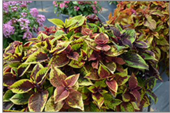
Premium Sun Pineapple Surprise Coleus

Premium Sun Pineapple Surprise Coleus will grow to be about 24 inches tall at maturity, with a spread of 20 inches. When grown in masses or used as a bedding plant, individual plants should be spaced approximately 18 inches apart. It grows at a fast rate, and under ideal conditions can be expected to live for approximately 5 years. As an evergreen perennial, this plant will typically keep its form and foliage year-round.