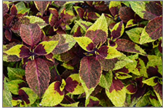
Premium Sun Pineapple Surprise Coleus foliage

Premium Sun Pineapple Surprise Coleus is recommended for the following landscape applications;