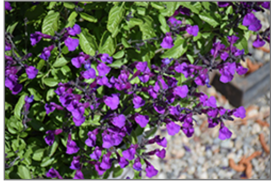
Vibe Ignition Purple Sage flowers