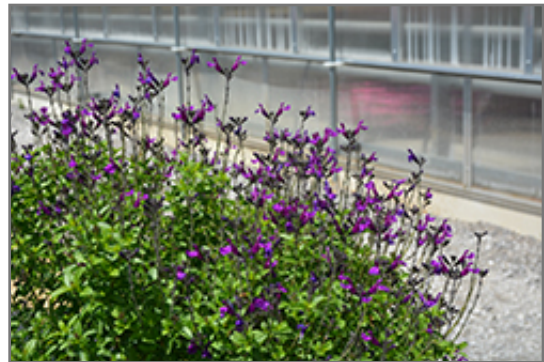
Vibe Ignition Purple Sage in bloom