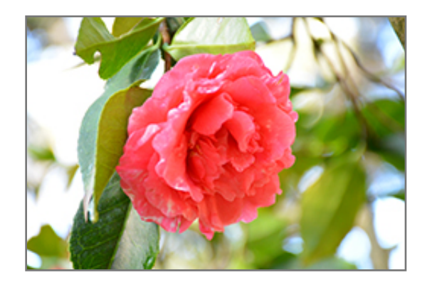
Daikagura Camellia flowers