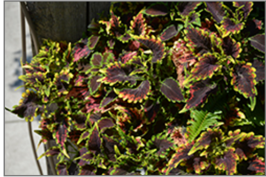
Sky Fire Coleus foliage

Sky Fire Coleus is recommended for the following landscape applications;