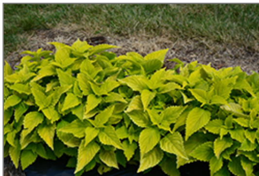
ColorBlaze Lime Time Coleus