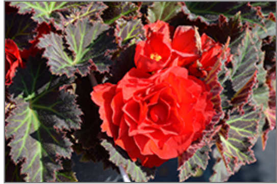
Nonstop Mocca Red Begonia flowers

Nonstop Mocca Red Begonia is recommended for the following landscape applications;