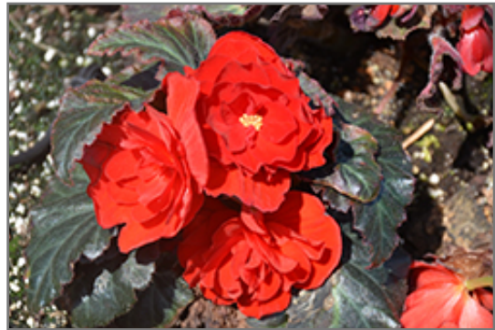
Nonstop Mocca Red Begonia flowers