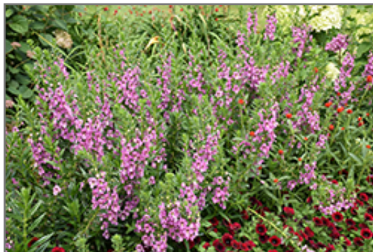
Angelface Super Pink Angelonia in bloom