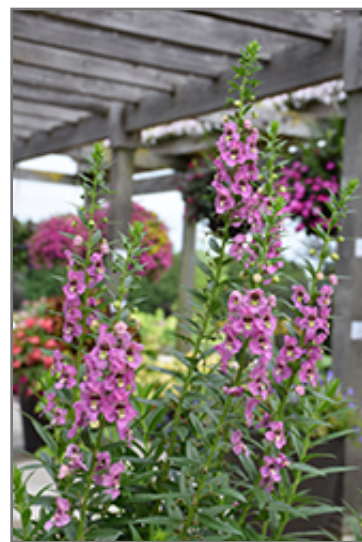
Angelface Super Pink Angelonia flowers