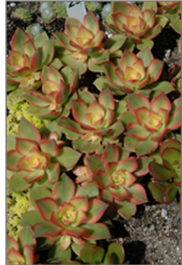
Kiwi Aeonium