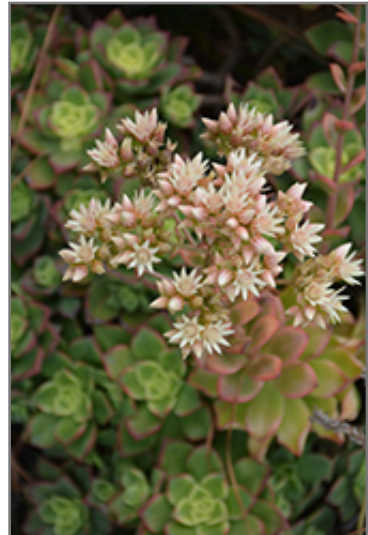
Kiwi Aeonium flowers