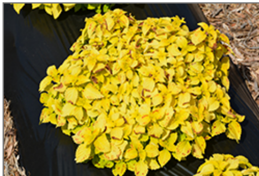
Terra Nova Pepperpot Coleus

Terra Nova Pepperpot Coleus is recommended for the following landscape applications;