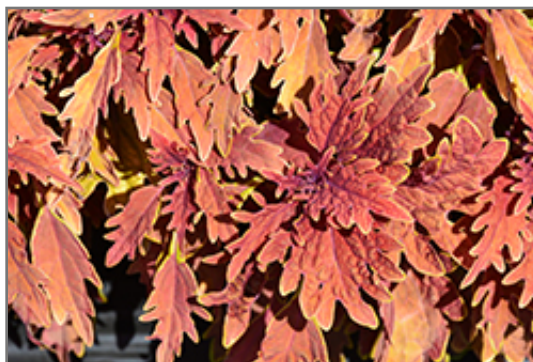
Terra Nova Fiona Coleus foliage

Terra Nova Fiona Coleus is recommended for the following landscape applications;