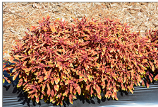
Hipsters Jasper Coleus