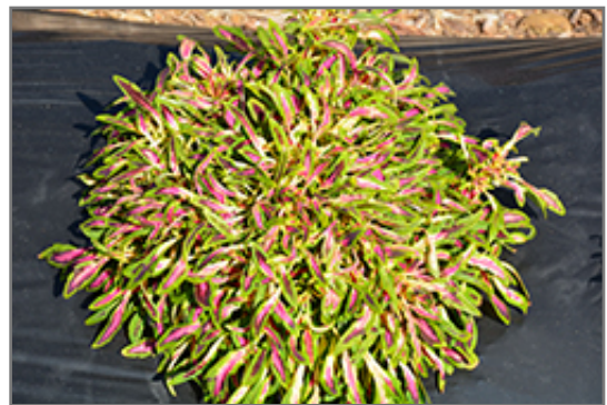
Fancy Feathers Pink Coleus