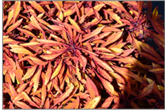
Fancy Feathers Copper Coleus foliage

Fancy Feathers Copper Coleus is recommended for the following landscape applications;