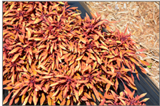
Fancy Feathers Copper Coleus