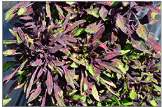
Fancy Feathers Black Coleus foliage

Fancy Feathers Black Coleus is recommended for the following landscape applications;