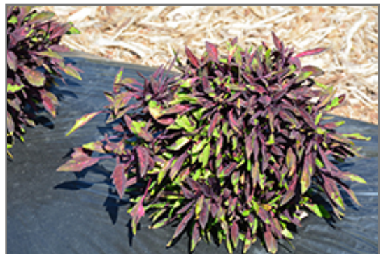
Fancy Feathers Black Coleus