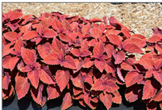
Color Clouds Valentine Coleus