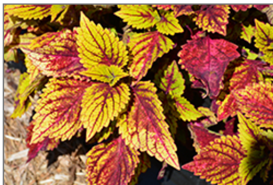
Color Clouds Hottie Coleus foliage

Color Clouds Hottie Coleus is recommended for the following landscape applications;