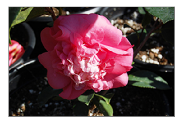
Chandleri Elegans Camellia flowers

Chandleri Elegans Camellia will grow to be about 8 feet tall at maturity, with a spread of 6 feet. It has a low canopy with a typical clearance of 1 foot from the ground, and is suitable for planting under power lines. It grows at a medium rate, and under ideal conditions can be expected to live for 40 years or more.