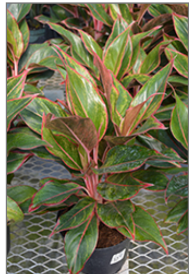
Siam Aurora Chinese Evergreen in full