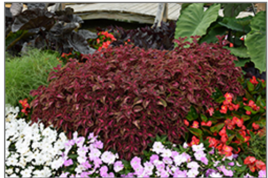
ColorBlaze Velveteen Coleus