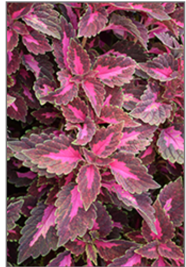
ColorBlaze Velveteen Coleus foliage

ColorBlaze Velveteen Coleus is recommended for the following landscape applications;