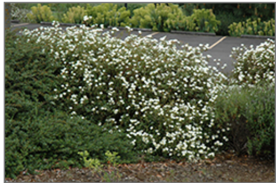
White Rockrose in bloom