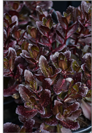
Touchdown Teak Stonecrop foliage

Touchdown Teak Stonecrop is a fine choice for the garden, but it is also a good selection for planting in outdoor pots and containers. With its upright habit of growth, it is best suited for use as a 'thriller' in the 'spiller-thriller-filler' container combination; plant it near the center of the pot, surrounded by smaller plants and those that spill over the edges. Note that when growing plants in outdoor containers and baskets, they may require more frequent waterings than they would in the yard or garden.