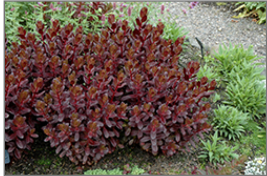
Touchdown Teak Stonecrop

Touchdown Teak Stonecrop is a dense herbaceous perennial with an upright spreading habit of growth. Its medium texture blends into the garden, but can always be balanced by a couple of finer or coarser plants for an effective composition.