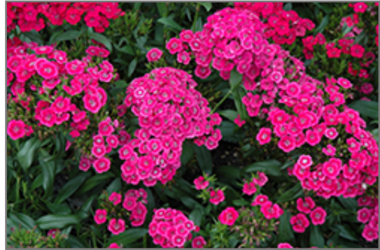
Jolt Pink Hybrid Pinks flowers

This is a relatively low maintenance plant, and is best cleaned up in early spring before it resumes active growth for the season. It is a good choice for attracting bees and butterflies to your yard, but is not particularly attractive to deer who tend to leave it alone in favor of tastier treats. It has no significant negative characteristics.