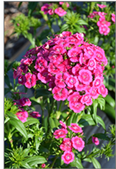
Jolt Pink Hybrid Pinks flowers