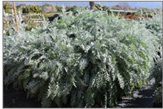
Velvet Centaurea

Velvet Centaurea will grow to be about 3 feet tall at maturity, with a spread of 7 feet. Its foliage tends to remain dense right to the ground, not requiring facer plants in front. It grows at a fast rate, and under ideal conditions can be expected to live for approximately 15 years. As an evergreen perennial, this plant will typically keep its form and foliage year-round.