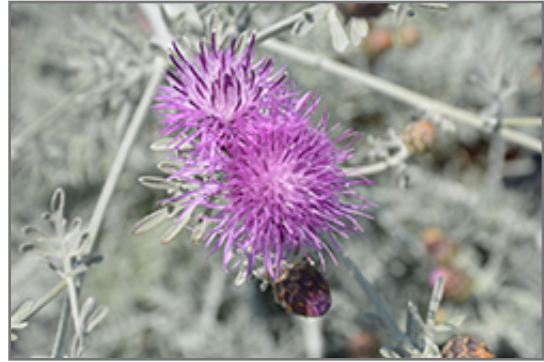
Velvet Centaurea flowers