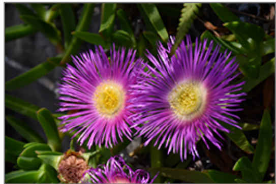
Trailing Iceplant flowers