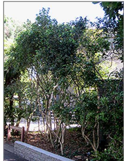
Orange Jessamine