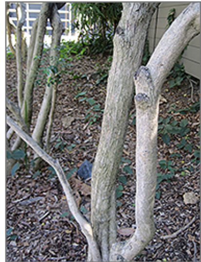
Orange Jessamine bark

Orange Jessamine is recommended for the following landscape applications;