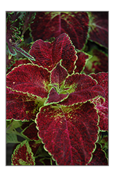
ColorBlaze Dipt in Wine Coleus foliage

ColorBlaze Dipt in Wine Coleus will grow to be about 24 inches tall at maturity, with a spread of 14 inches. When grown in masses or used as a bedding plant, individual plants should be spaced approximately 12 inches apart. It grows at a fast rate, and under ideal conditions can be expected to live for approximately 5 years. As an evegreen perennial, this plant will typically keep its form and foliage year-round.