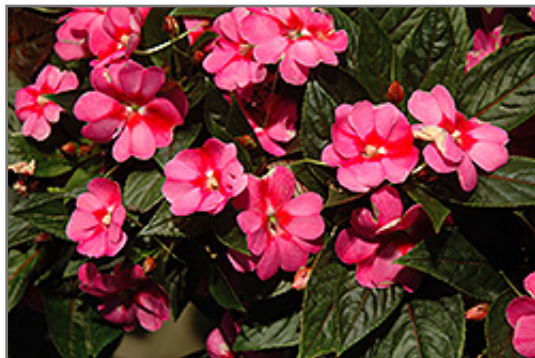
Harmony Marshmallow Cream New Guinea Impatiens flowers

Harmony Marshmallow Cream New Guinea Impatiens is recommended for the following landscape applications;