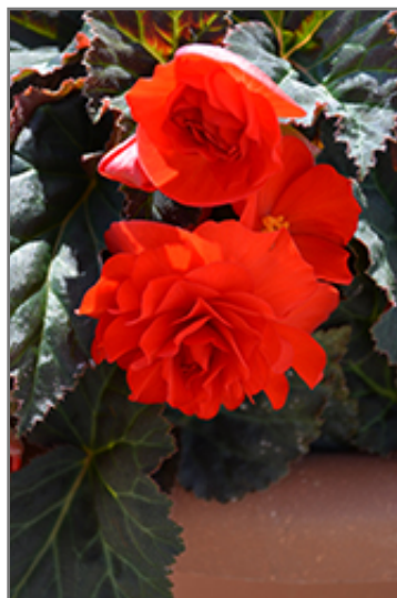
Nonstop Mocca Scarlet Begonia flowers