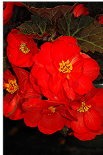
Nonstop Mocca Scarlet Begonia flowers

Nonstop Mocca Scarlet Begonia is recommended for the following landscape applications;